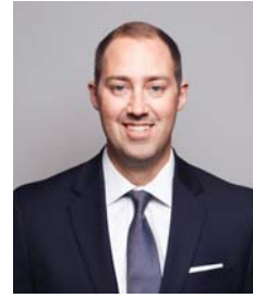
Philip Bird Office & Investment