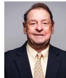
Dan Sheeran Industrial & Investment