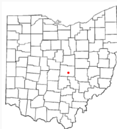
Location of Heath, Ohio