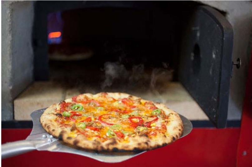
Click image for slideshow

On an opening-day visit, I was so blown away by the great pizzas and general sophistication of Harvest Pizzeria I couldn't believe it'd only been in business for a few hours. Ergo I went back the very next day to confirm what I ate was in fact that sensational. Well, it was, and frankly it's a damn good bet I'm perched on a seat there right now, buzzsawing through marvelous Harvest munchies while you're reading this.