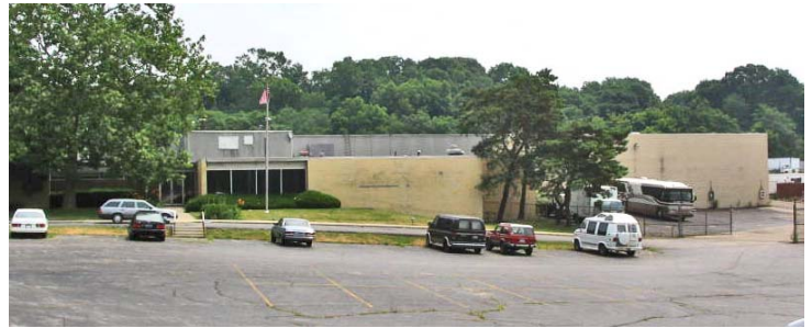
1400 Dublin Rd - Front