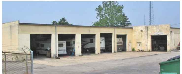
1400 Dublin Rd. Rear