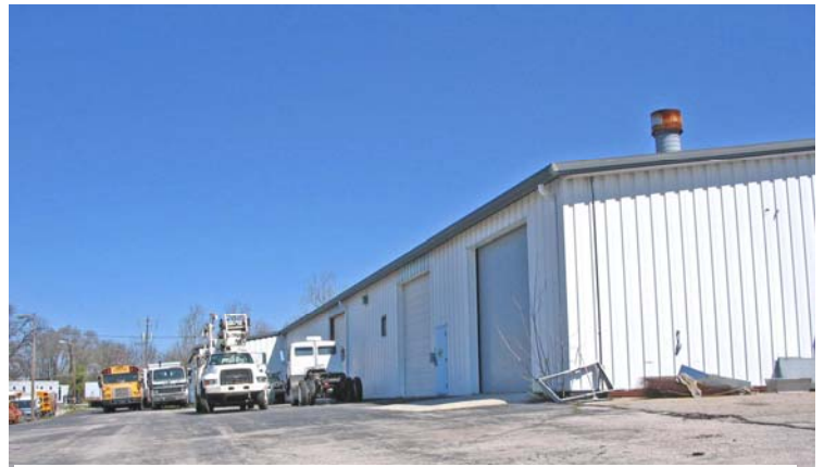
2299 Cardington Ave.