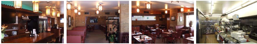
BUILDING #2 INTERIOR PHOTOGRAPHS