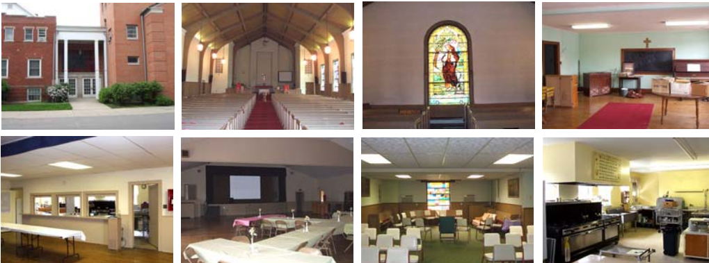
INTERIOR AND EXTERIOR PHOTOGRAPHS