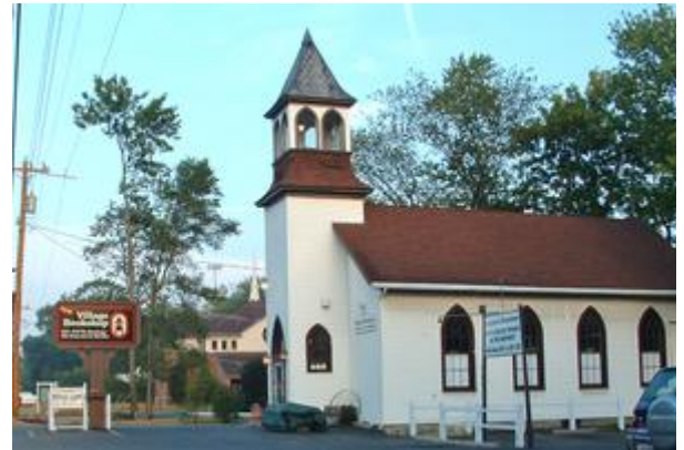
FRANKLIN COUNTY AUDITOR

Built in 1910, it was a small church before it was converted into an independent bookstore in 1969. Friedlinghaus and his family took over the operation in 1983 and ran it until its recent closure . The shop famously advertised overstocked new books marked down by 50 to 90 percent off their listed price.