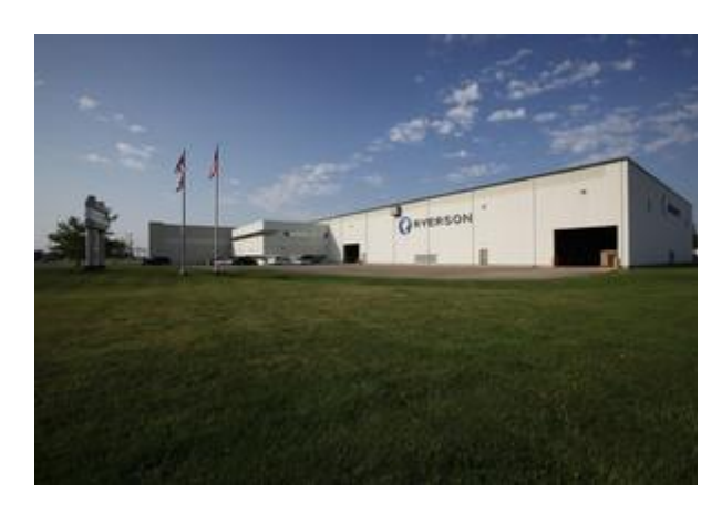
Ryerson will maintain operations at 555 Yearling Road near John Glenn International.

Chicago-based Ryerson will maintain operations there, processing and distributing stainless steel, aluminum sheets and other metals.