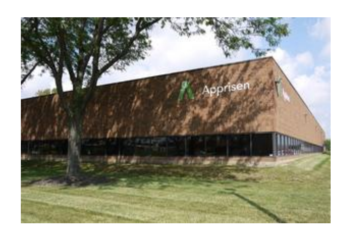
WHITEHALL Wasserstrom is moving its headquarters to this building on East Broad Street in Whitehall.

The restaurant products supplier closed on a $2.5 million purchase of the 50,572-square-foot building at 4500 E. Broad St., expecting to relocate by next summer from offices in the Brewery District, a shift of 225 workers that drew financial incentives from Whitehall. The value of the purchase wasn't