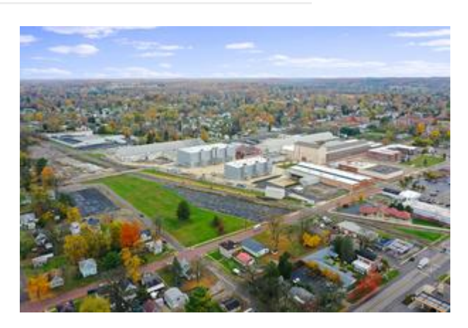
NAI OHIO EQUITIES The former Cooper Bessemer plant in Mount Vernon.

Doug Shull of NAI Ohio Equities has been retained to sell the 47-acre site, which includes 670,000 square feet of manufacturing, assembly, distribution and office space in Mount Vernon. The property includes 25 buildings from 12,000 to 112,000 square feet, 100 cranes from two-ton